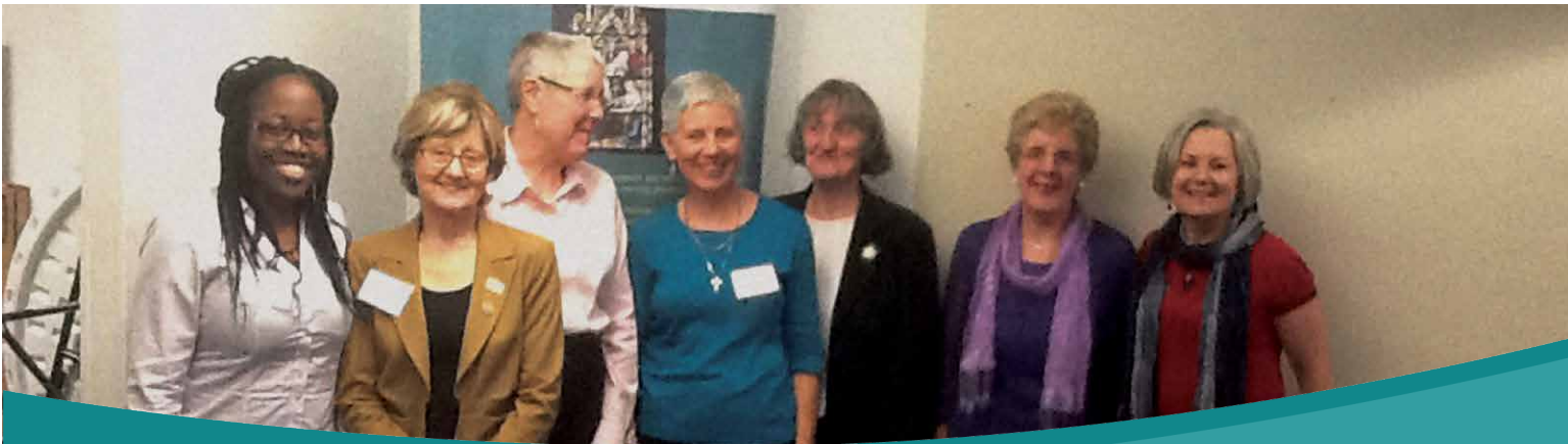
At the AGM: from left to right: