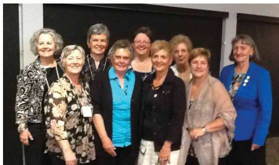
There was a large delegation from Ontario.

This was indeed a stimulating conference overlaid with casual Western friendliness.